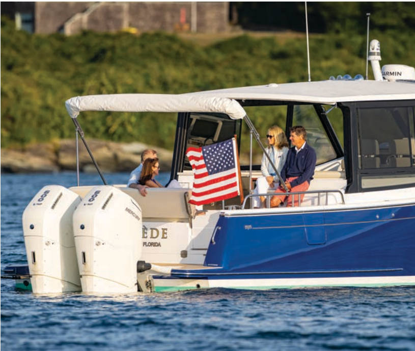
Convertible double sunlounge aft