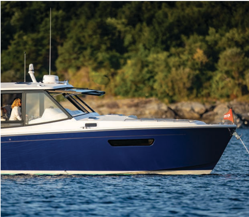
Opening electric windshields